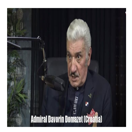
Why Hypersonic Weapons Change Everything