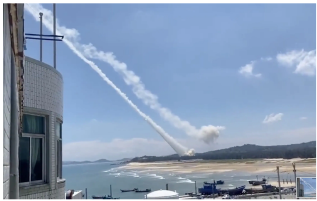
Via The Telegraph/@Military_News4

Taipei's defense ministry immediately condemned the severe provocation: "The defence ministry condemned the irrational actions to undermine regional peace," a statement said. Taiwan further called on Beijing to be "self-restrained".