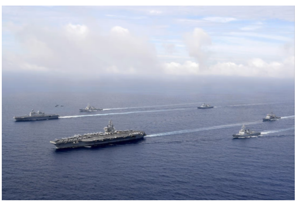
File image of USS Ronald Reagan pictured during an exercise with South Korean warships, via AP.

The U.S. will also conduct "standard air and maritime transits through the Taiwan Strait in the next few weeks , consistent with our long-standing approach to defending the freedom of the seas and international law," he added.