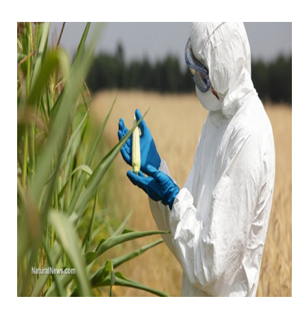
When Green Turns Brown – And Nobody Notices