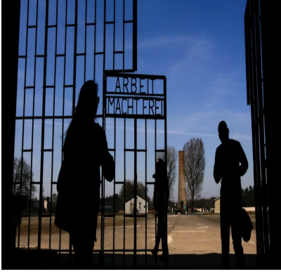
Visitors enter Sachsenhausen through a gate with the words "Arbeit macht frei" ("Work sets you free").