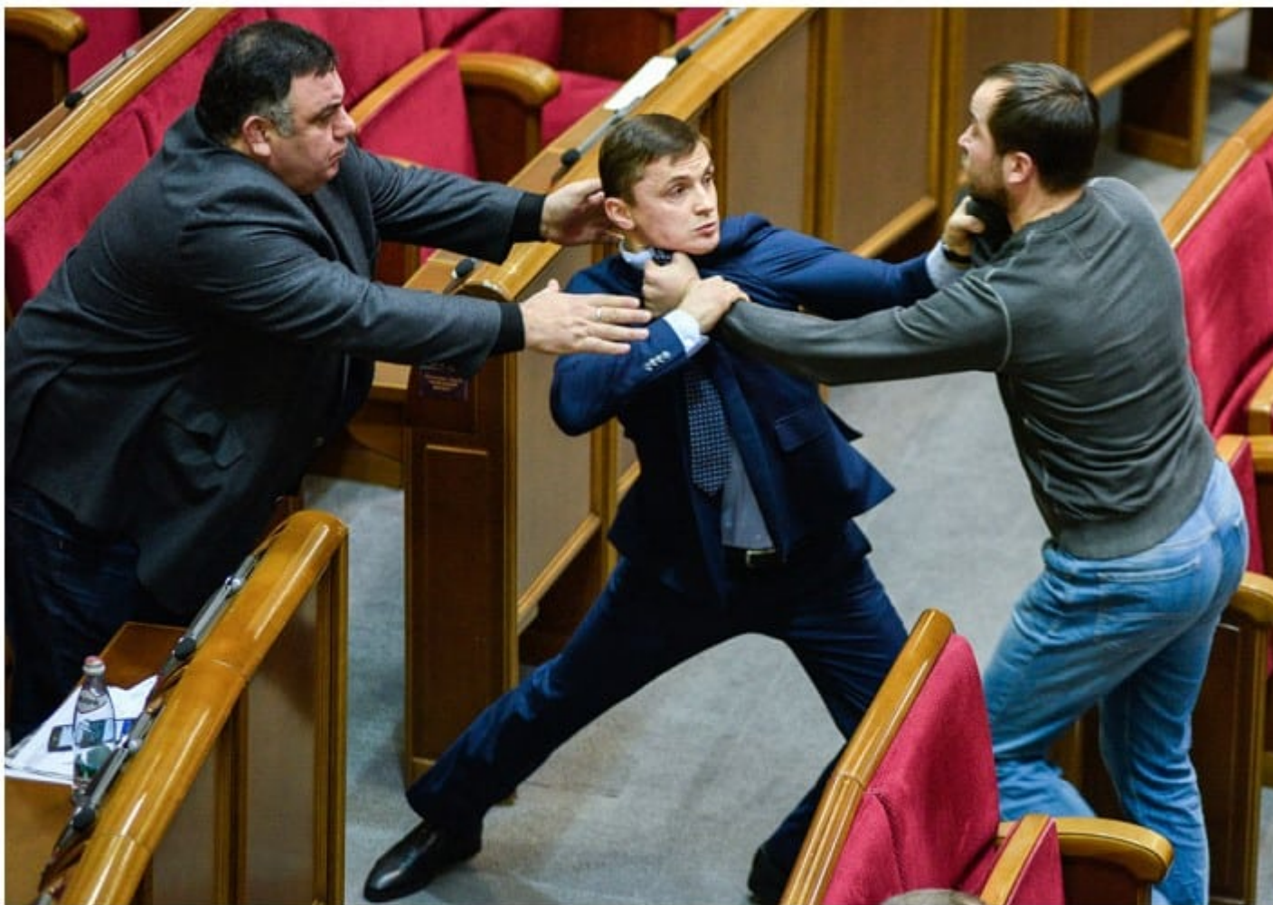
A belated Christmas greeting from the Parliament of Ukraine, Radan