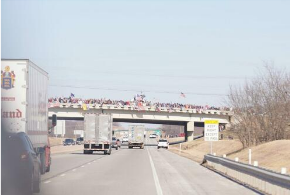
Truckers part of The People's Convoy drive past an overpass with supporters in Oklahoma on Feb. 27, 2022.