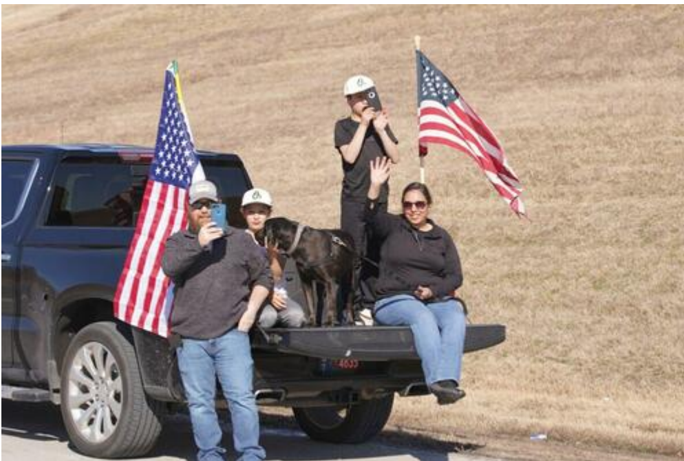
Convoy supporters wave American flags by the side of the road in Oklahoma on Feb. 27, 2022.