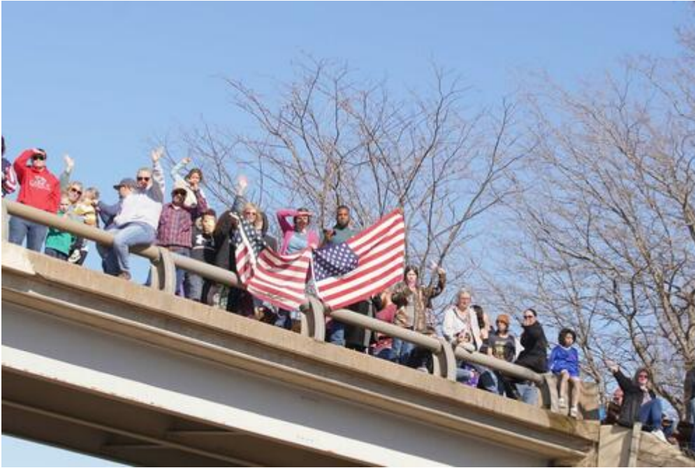
Convoy supporters in Oklahoma on Feb. 27, 2022.