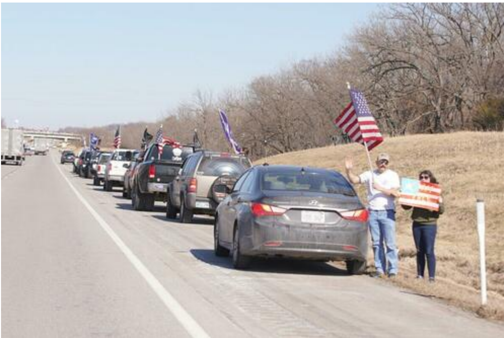
Convoy supporters in Oklahoma on Feb. 27, 2022.

Organizers have been sending drones up periodically to capture estimates of vehicles traveling with the group, which has drawn thousands of people to roadsides as the convoy passes by.