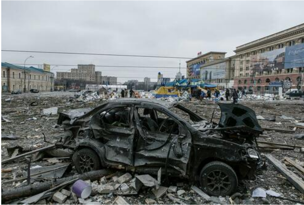
Kharkiv's central square

On Monday Turkey had closed the straits under its control to all warship traffic, especially Russian vessels, in line with the Montreux Convention.