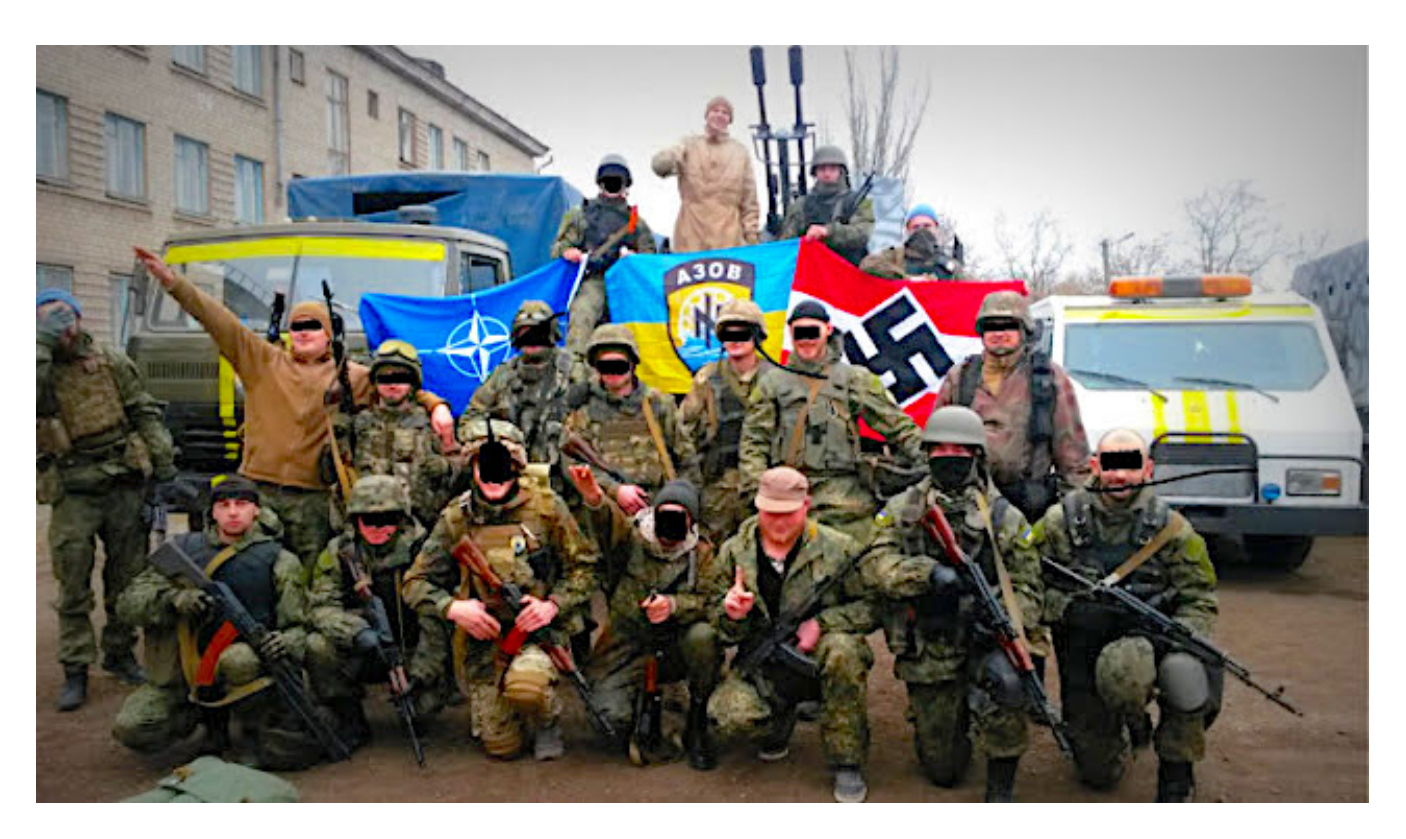
Azov Battalion members.

Any mention of that sordid reality was deemed "Russian propaganda" and anyone who spoke this inconvenient truth was a "stooge of Moscow." It wasn't until July 7 that the Times admitted the importance of the neo-Nazis and other ultra-nationalists in waging war against ethnic Russian rebels in the east. The Times also reported that these far-right forces had been joined by Islamic militants. Some of those jihadists have been called "brothers" of the hyper-brutal Islamic State.