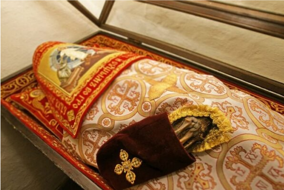
St. Agapit of the Kiev Caves