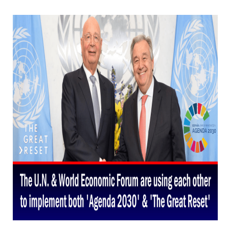
The U.N. & World Economic Forum are using each other to implement 'Agenda 2030' & 'The Great Reset'