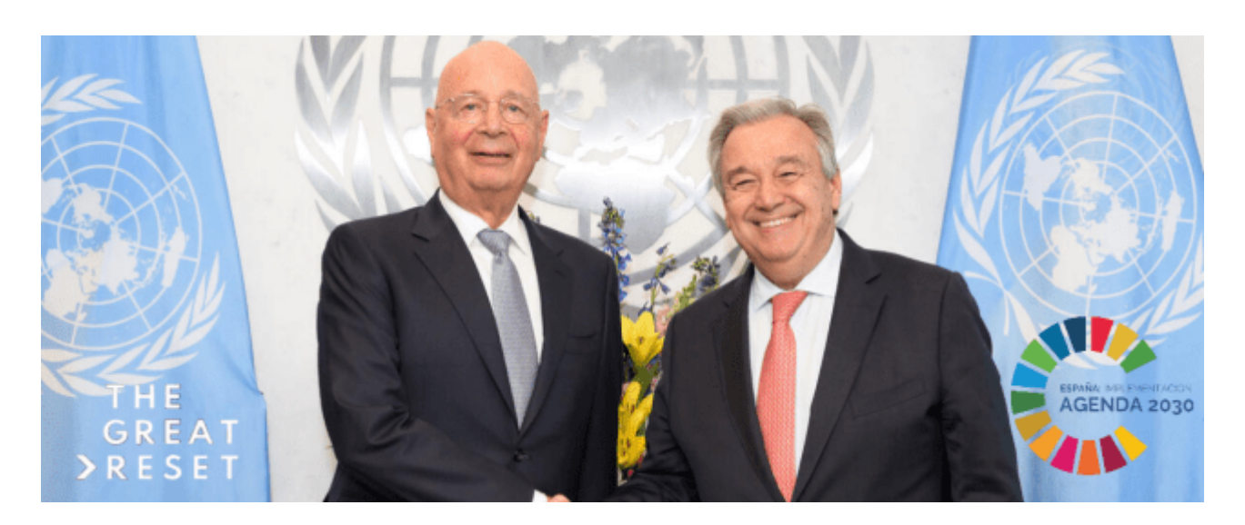
The UN's Agenda 2030 for Sustainable Development ("Agenda")

None of these organisations or companies has officials which represent the people. We have not elected them into office to govern or make decisions on our behalf. And, no electorate has been asked if their goals are our goals or if their goals will create the world we, the people, want.