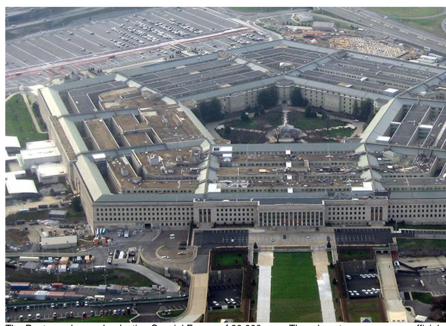
The Pentagon has a clandestine Special Forces of 60,000 men. They do not appear on any official of without uniform. Supposedly used against terrorism, they are in fact the ones who practice it. The class to the fight against Russian and Chinese rivals.