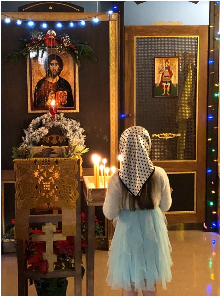
San Antonio's Sts. Joachim and Anna Russian Orthodox Church.