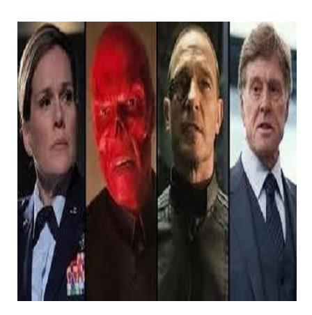
The DARPA-Taped Letters