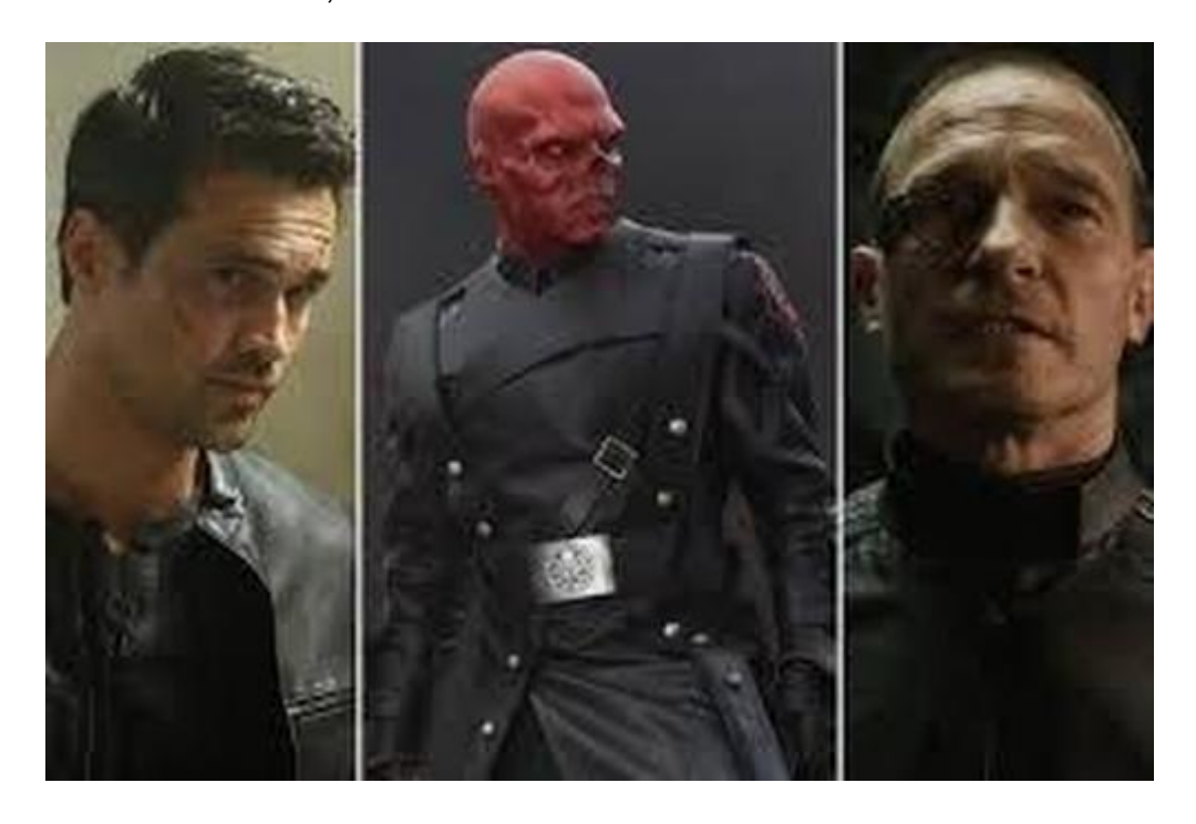
Strangely enough, they were never heard from again!!