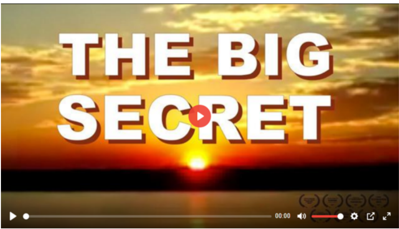
The Big Secret, Medical Documentary (73 mins)

<u>According to IMDb</u>, the full documentary is 2 hours 4 mins. However, the version below is shorter at 1 hour 13 mins. Click on the image below to watch the <u>video on Bitchute</u>.