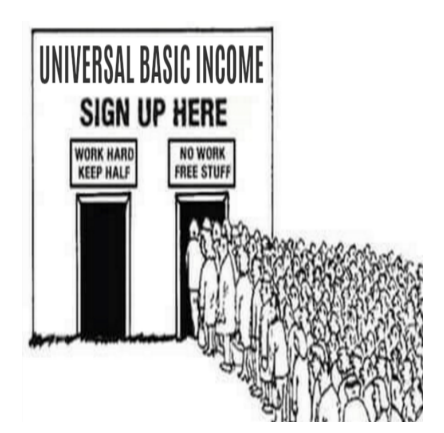
The $1 Trillion Child Tax Credit Is Really Universal Basic Income