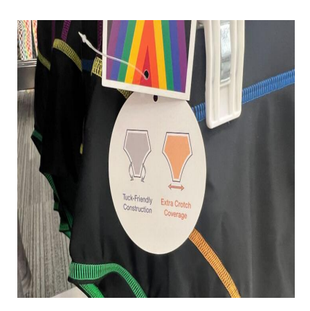
Target Stores Hit With Bomb Threat After 'Turning Its Back' On LGBTQ+ Community