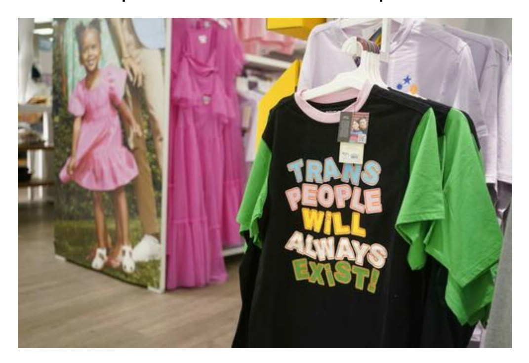
"Target is full of [redacted] cowards who turned their back on the LGBT community and decided to cater to homophobic right wing, redneck, bigots, who protested and vandalized their store," reads a threatening email sent to several Target locations in Ohio and one in Pennsylvania, Cleveland 19 News reports.

At least five Targets in multiple states received bomb threats Friday over company executives pulling the Pride collection section because of mounting boycotts, leading to multiple stores being evacuated as police and the FBI searched for explosive devices.