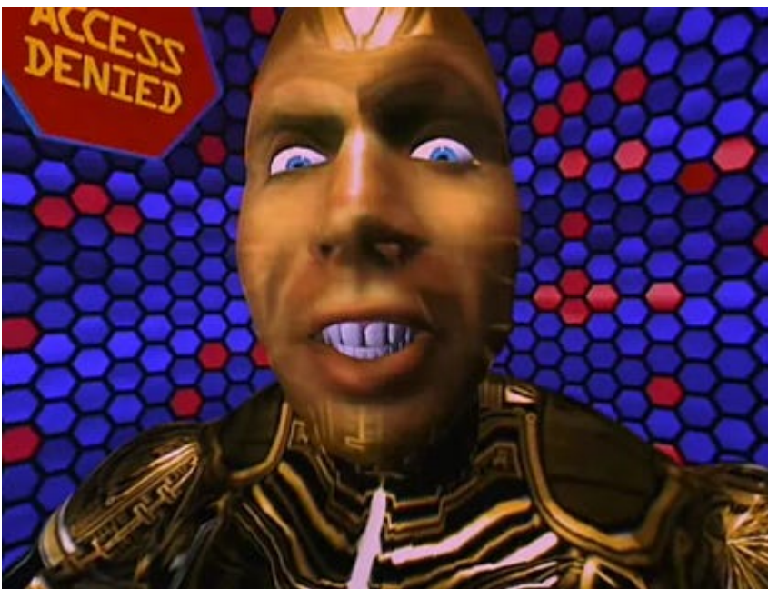
Screenshot: "The Lawnmower Man" (1992)

Some would call this biohorror, but transhumanists revere the "Moravec Transfer" as a pioneering vision of synthetic salvation.