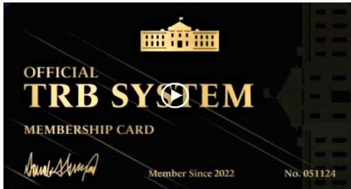
President Trump TRB Card

Unbeknownst to victims or their loved ones, HAARP projects ultra-high-powered radio waves. Those waves operate at the same electronic frequency as the truncus encephali, or brain stem, selectively inducing deaths seemingly by natural causes – including by some appearing to coroners as innocuous as strokes or heart attacks.