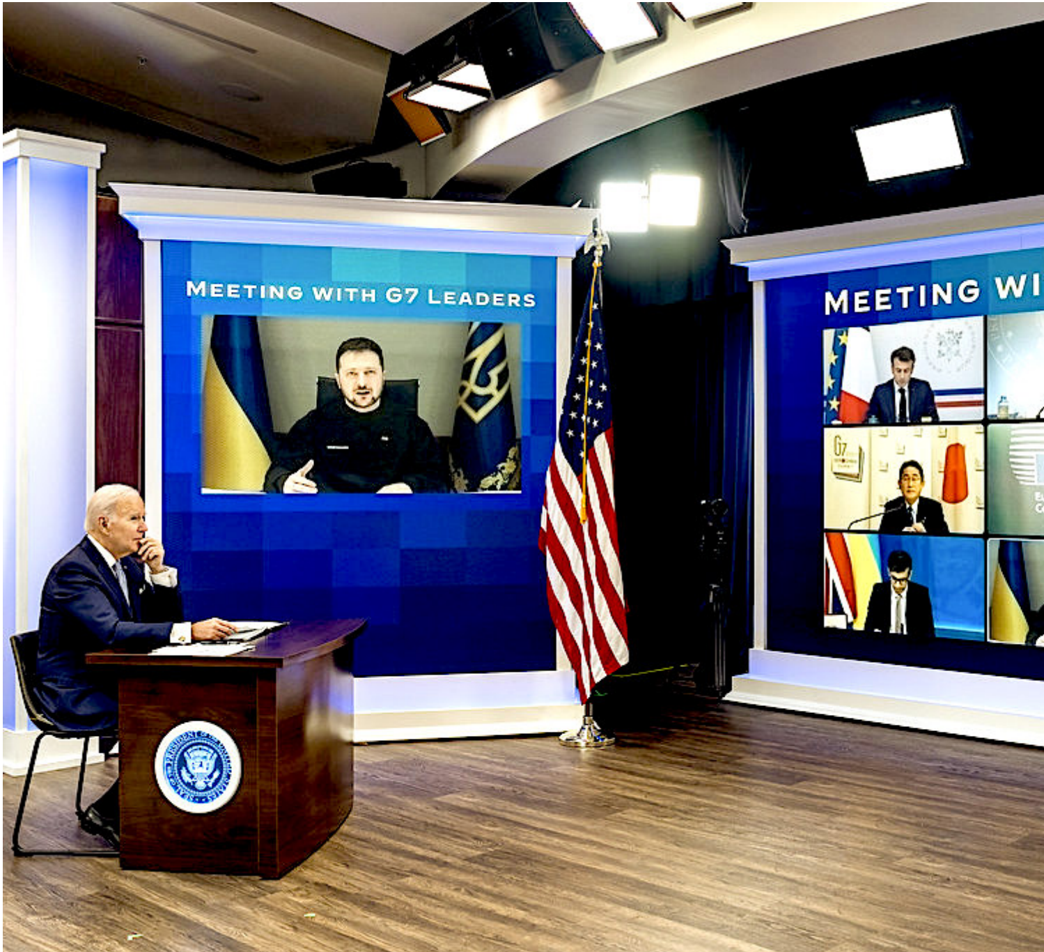
U.S. President Joe Biden in virtual call with G7 leaders and Ukrainian President Volodymyr Zelenskyy, Feb. 24.

Since the Russian invasion of Ukraine, an ideological divide that has gripped the world, with one side (led by the G7) condemning the invasion and seeking to punish Russia economically, and the other (led by BRICS) taking a more nuanced stance by neither supporting the Russian action nor joining in on the sanctions. This has created a intellectual vacuum when it comes to assessing the true state of play in global economic affairs.