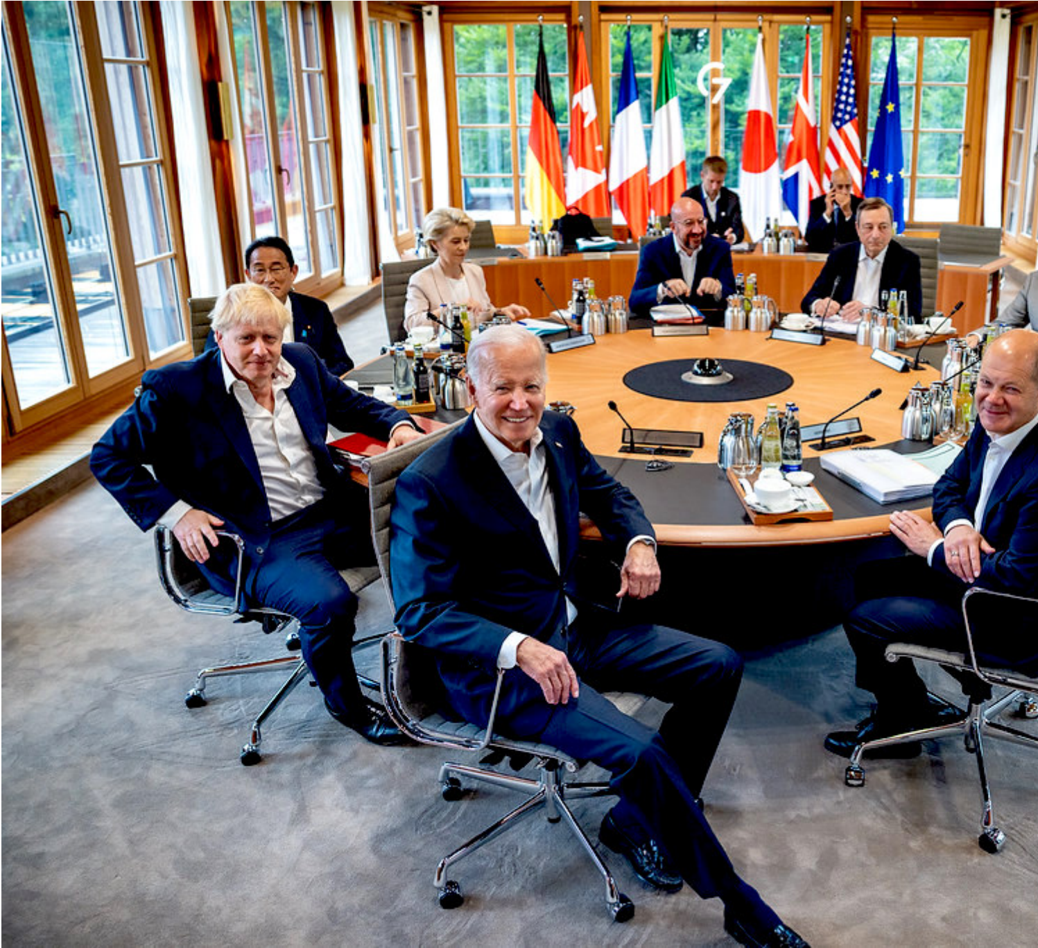
G7 leaders meeting on June 28, 2022, at Schloss Elmau in Krün, Germany.