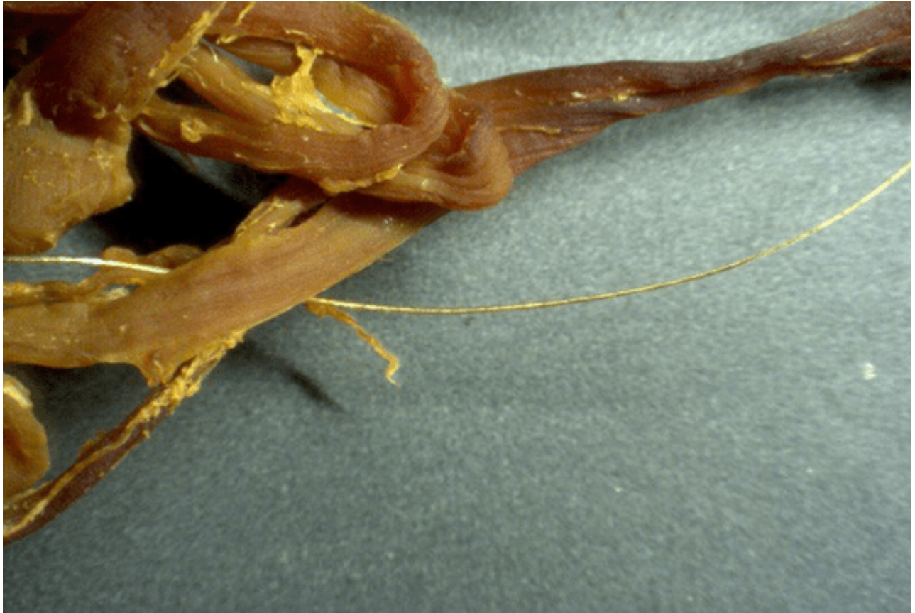
Gold Nanowire – InfoWars

I believe the image below that was shared by Mike Adams on InfoWars, shows a gold nanowire.