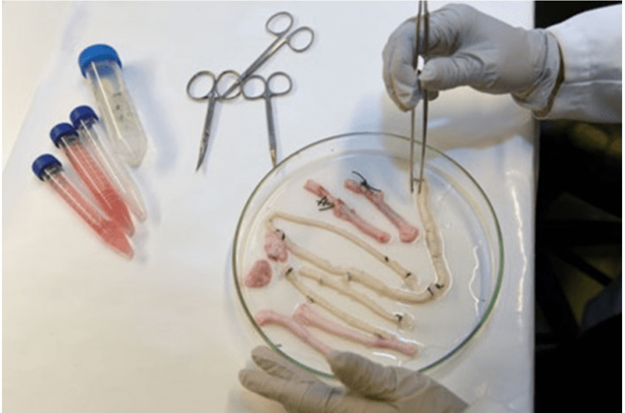
Artificial blood vessels