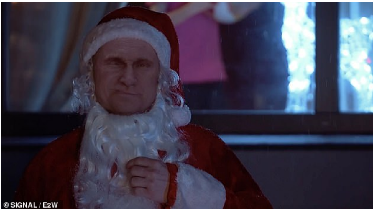
Pictured: Putin Santa lowers his beard as he departs the home, so there is no doubt at his supposed identity. He winks and smiles, before walking off into the night