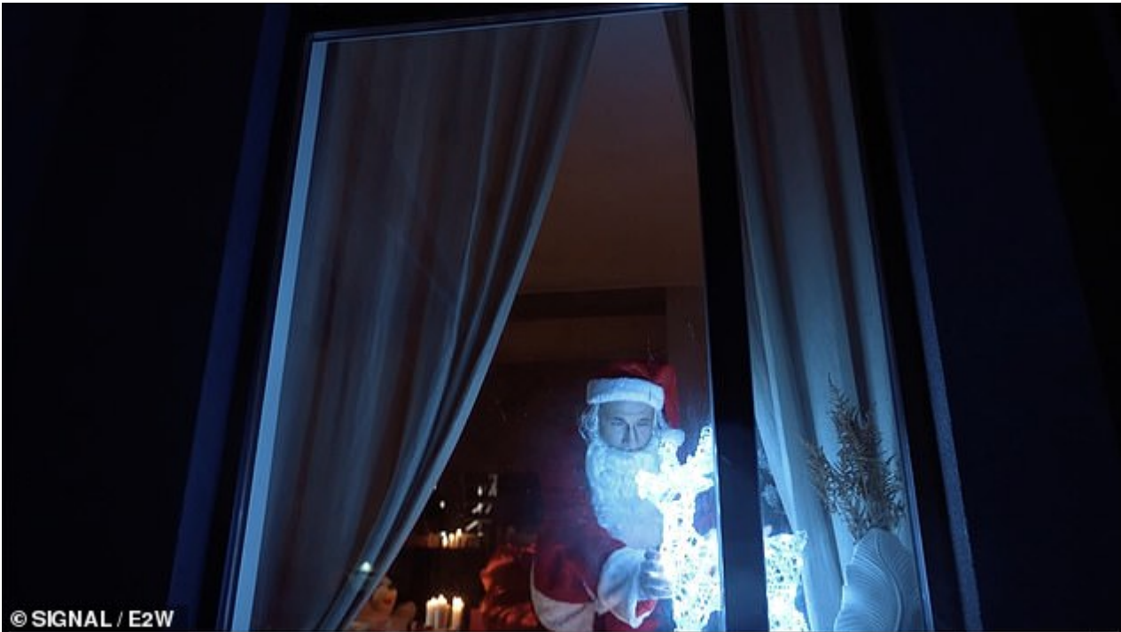
Pictured: Santa Putin is seen putting up Christmas decoration's in the boy's home