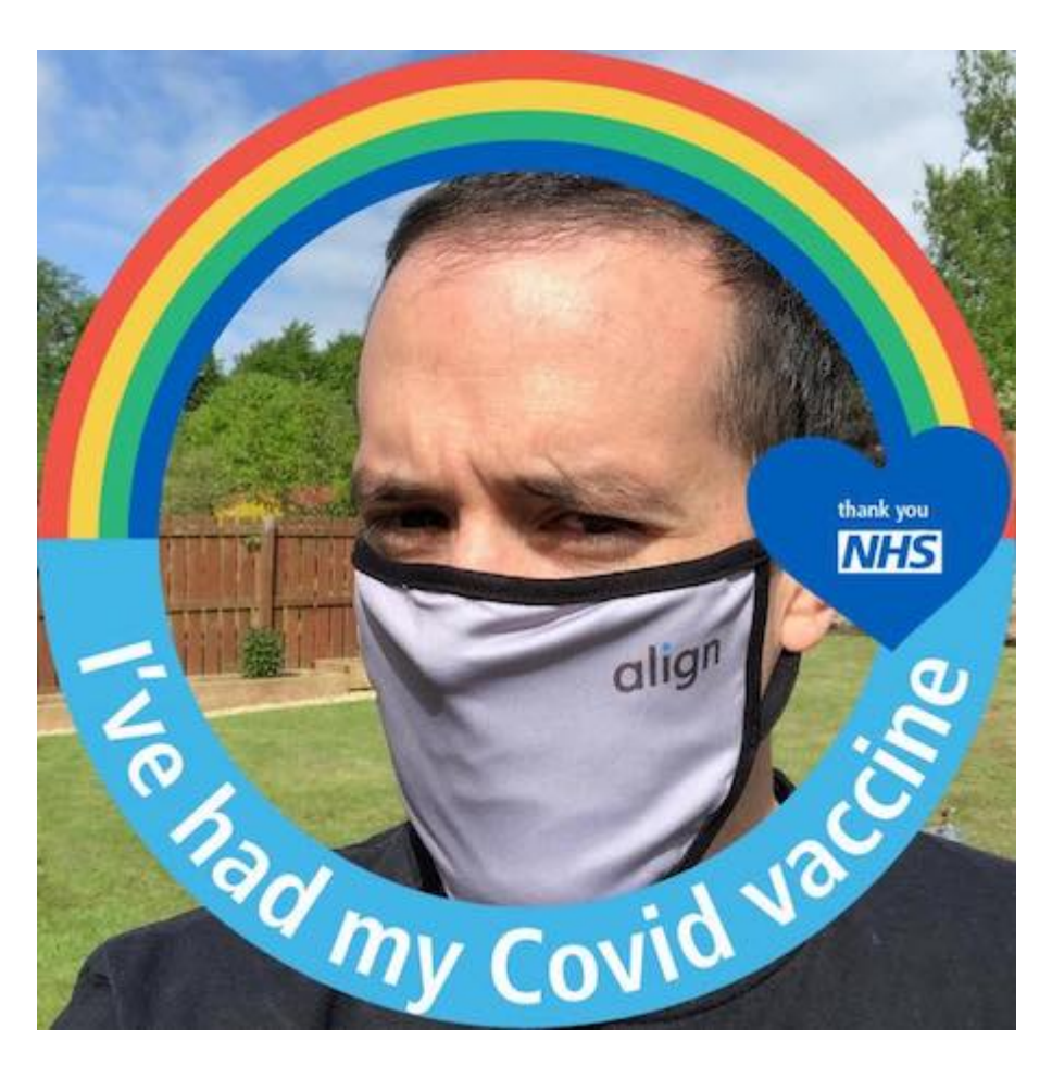
"Thank you, NHS."