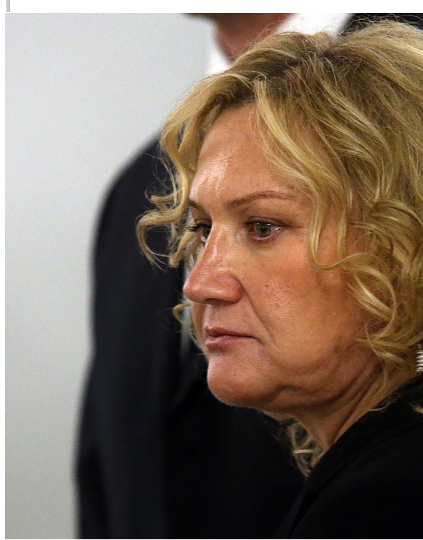
A source told The Post that Yelena Baturina and her husband ex-Moscow Mayor Yury