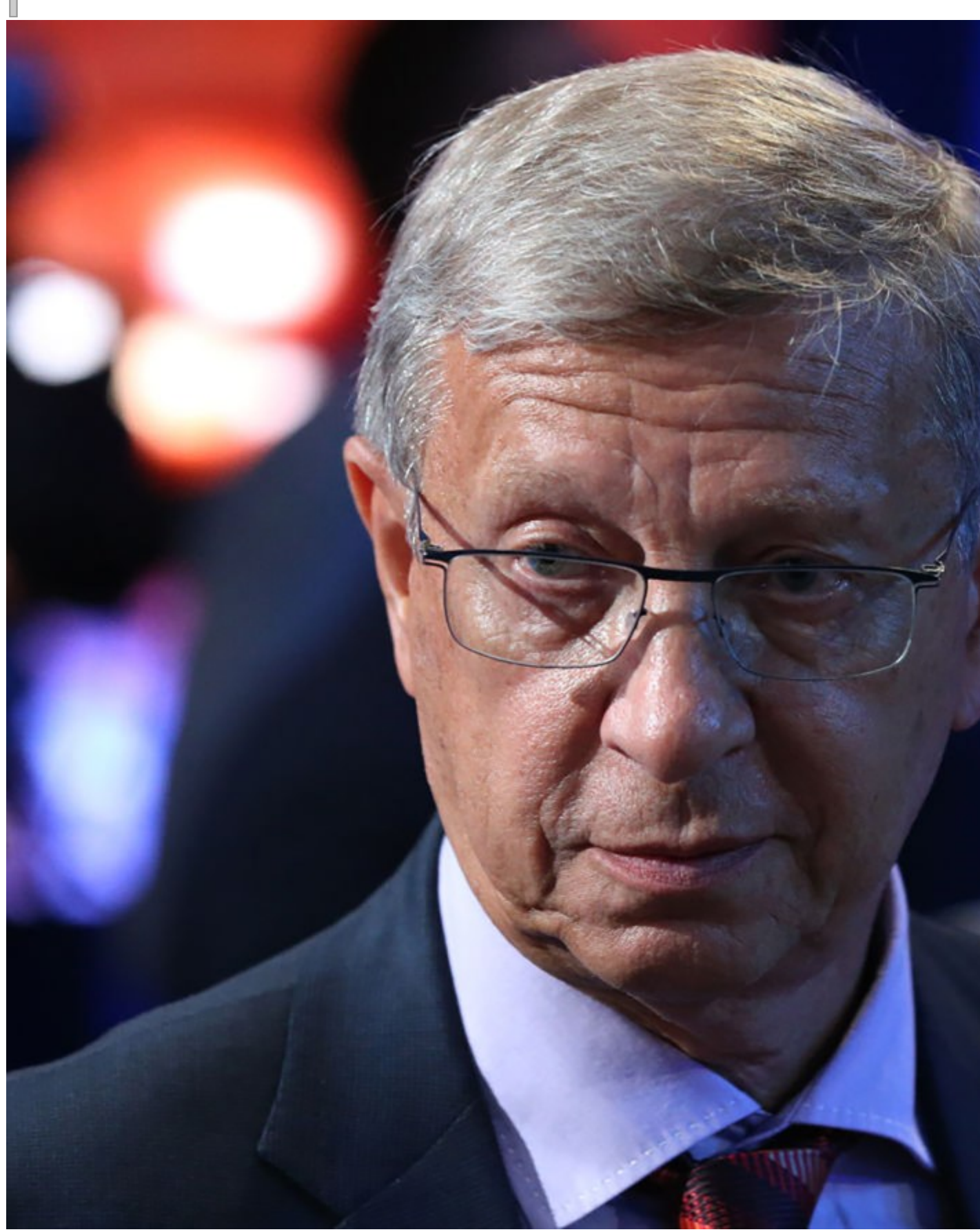
Emails from Hunter Biden's laptop show he has met with Vladimir Yevtushenkov and toured