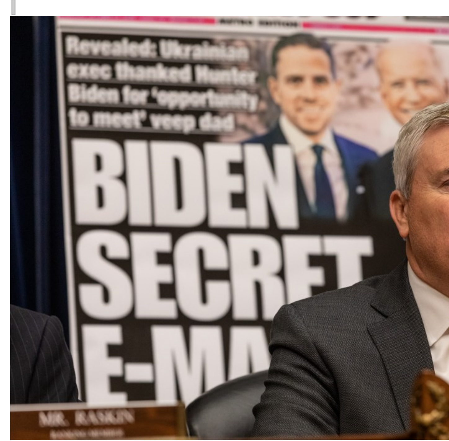
House Oversight Committee Chairman Rep. James Comer called the lack of sanctions on the Biden-connected oligarchs "alarming."

"It is extremely concerning that Biden-linked Russian nationals are avoiding sanctions. If this happened under a Republican White House, the mainstream media would be up in arms," added Sen. Marsha Blackburn (R-Tenn.). "This latest report is further proof of the deep level of corruption occurring with Hunter Biden and Biden Inc."