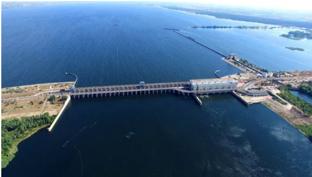
Kakhovka hydroelectric dam, file image

“Today at 10:00 there was a hit of six HIMARS rockets . Air defense units shot down five missiles, one hit a lock of the Kakhovka dam, which was damaged,” Russian news agencies quoted local emergency authorities as saying.