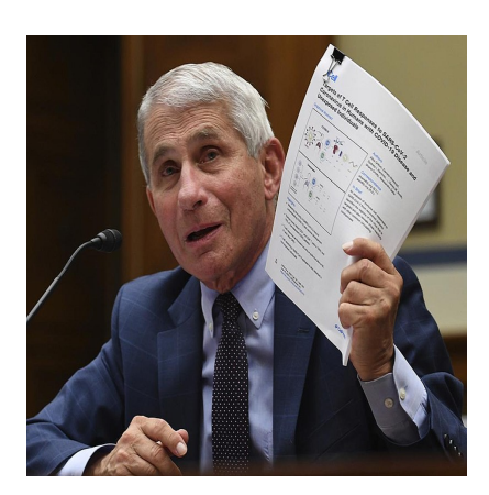
REVEALED: Fauci's Recent, $10M Monkeypox Grant.