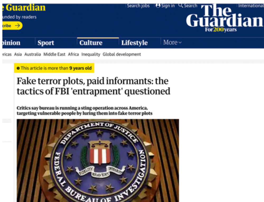
The Guardian, Nov. 16, 2011