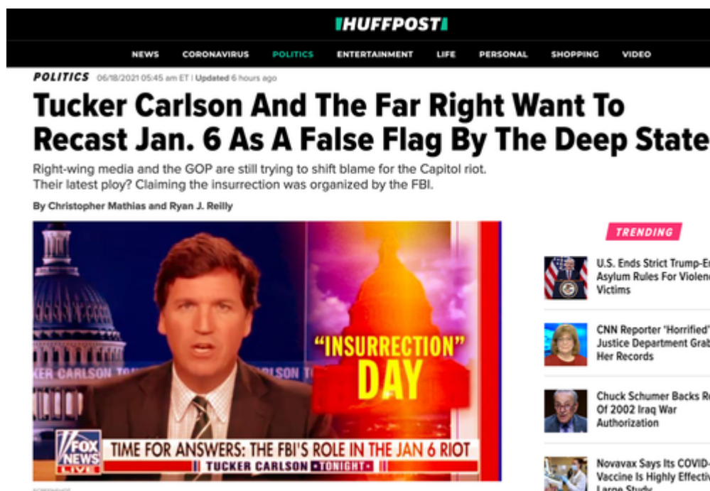
The Huffington Post, June 18, 2021

As it usually does, The Washington Post — which told Americans that Russians had invaded the U.S. electricity grid and that a huge army of Kremlin-loyal American writers was shaping our discourse — echoed the instant CNN/liberal consensus by mocking it as "Tucker Carlson's wild, baseless theory," claiming that "it's the kind of suggestion journalists in other organizations would quite possibly be fired for if they sought to push it nearly as hard." The standard liberal blob of HuffPost / DailyBeast / BusinessInsider all recited from the herd script. "A laughable conspiracy theory," chortled The Huffington Post , who has done more to help the FBI find citizens allegedly at the Capitol riot than any local law enforcement agency.