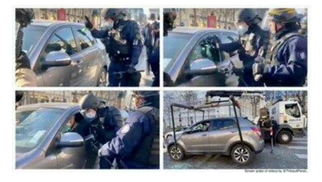
Authorities were very well prepared to handle demonstrators.