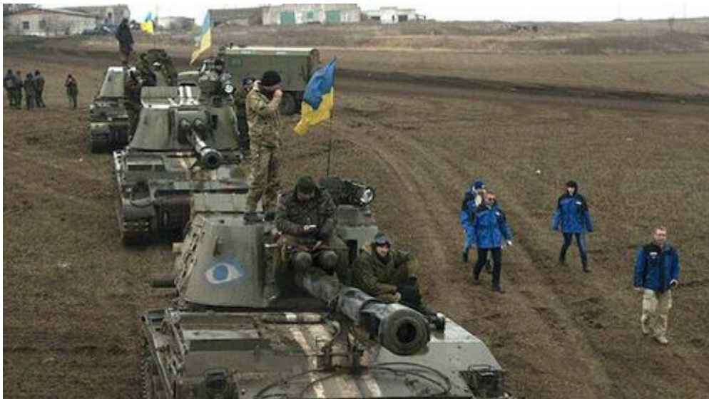
Archived image of Ukrainian troops in Donbas

Further the Kremlin is citing what it says is a major escalation, after reports that a Ukrainian shell hit and destroyed a Russian border checkpoint in the Rostov region. The Russian side now says Ukrainian munitions are landing on its sovereign soil, which some say could be used as a casus belli if Putin so chooses.