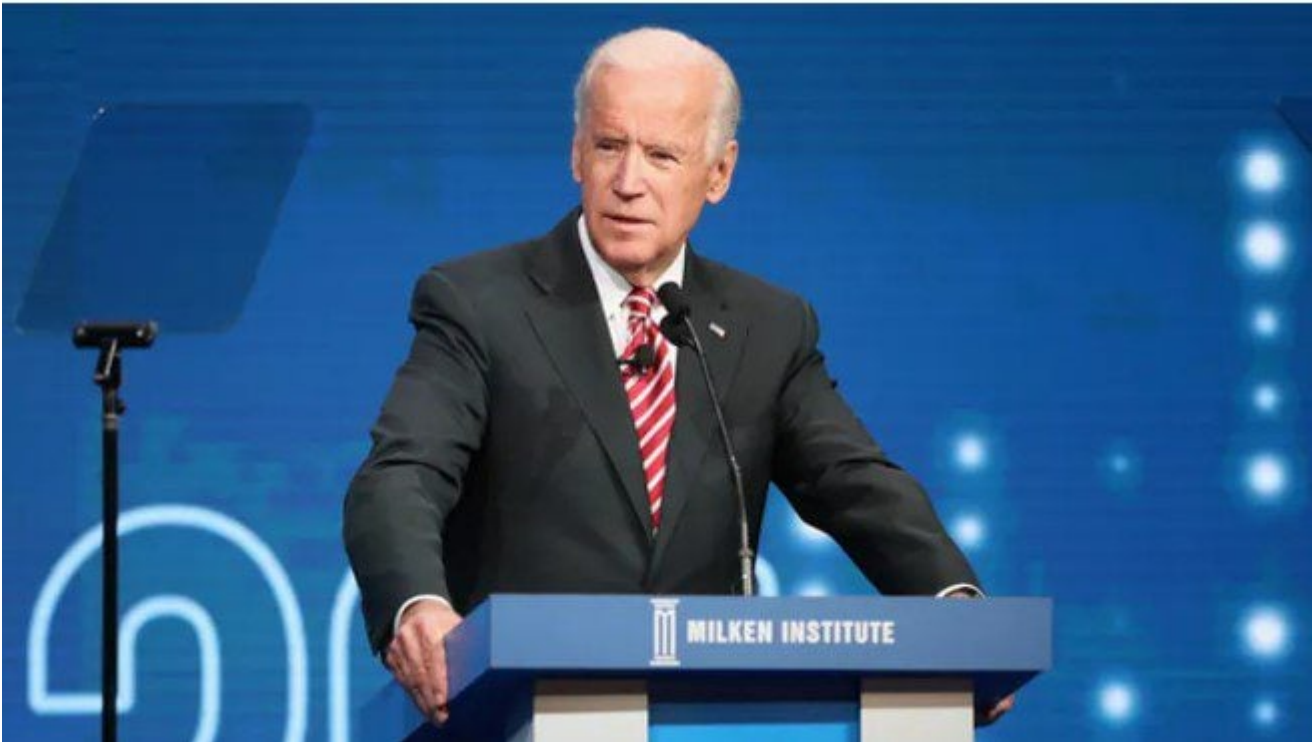
BEVERLY HILLS, CA – MAY 03: Former U.S. Vice President Joe Biden speak during the Milken Institute Global Conference 2017 at The Beverly Hilton Hotel on May 3, 2017 in Beverly Hills, California.