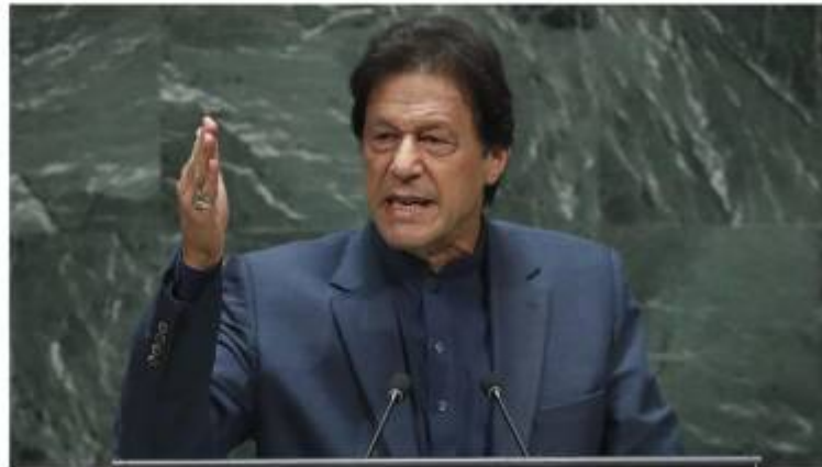
Pakistan, led by Imran Khan, abstained from a vote to denounce the invasion at the UN General Assembly

Pakistan's prime minister has lambasted western diplomats who have urged him to condemn Russia's invasion of Ukraine , demanding to know if they thought he was their "slave".