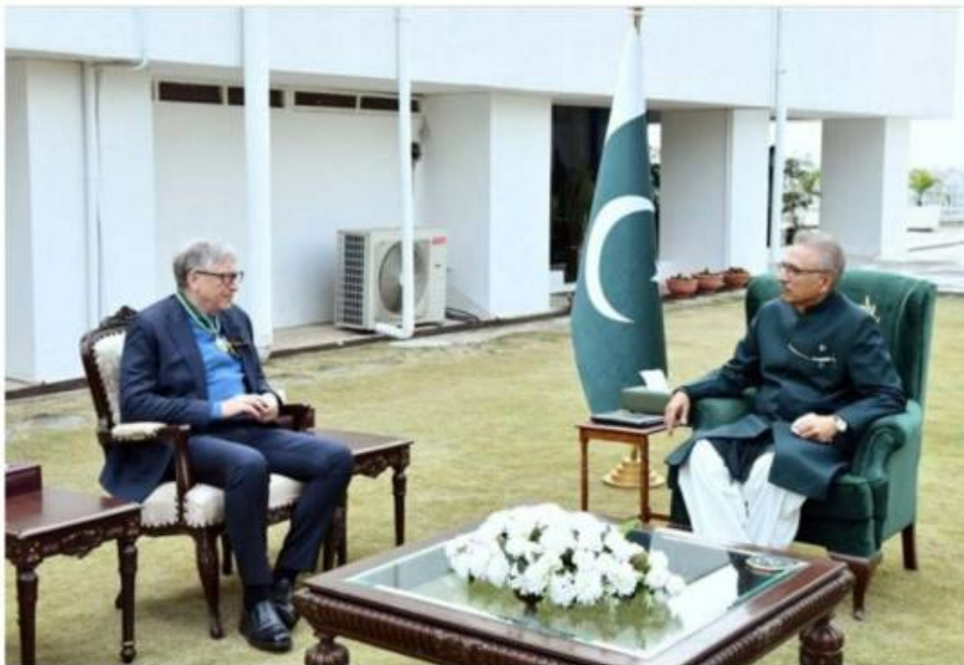
Microsoft Co-founder Bill Gates (L) and President Arif Alvi.