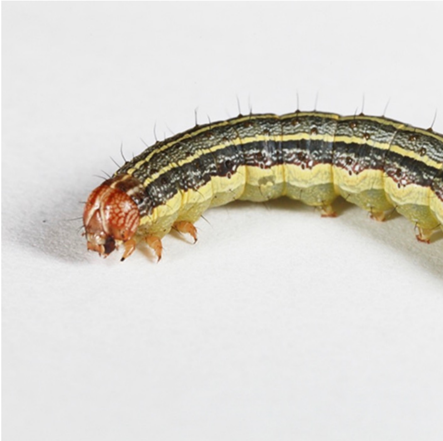
The fall armyworm

So, you are getting an additional 20% protein of insect and baculovirus origin in addition to the 5 mcg of spike protein, in each of your two doses.