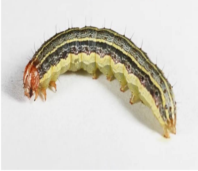
Novavax COVID-19 Vaccine Ingredient

Novavax Vaccine Contains 1 mcg Armyworm and Baculovirus Proteins Injected into you with Each Dose