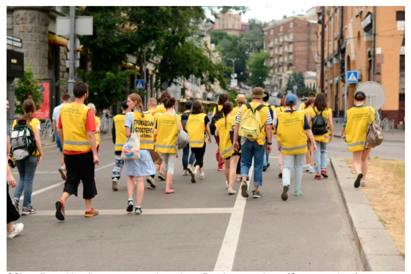
CCL staffers with yellow vests out to investigate Russian war crimes.

Further, the CCL has mounted an international campaign to release the Kremlin's political prisoners, and aims to raise awareness about political persecution in what it calls Russian-occupied Crimea—which is not "occupied" since its people voted to rejoin Russia in a referendum.