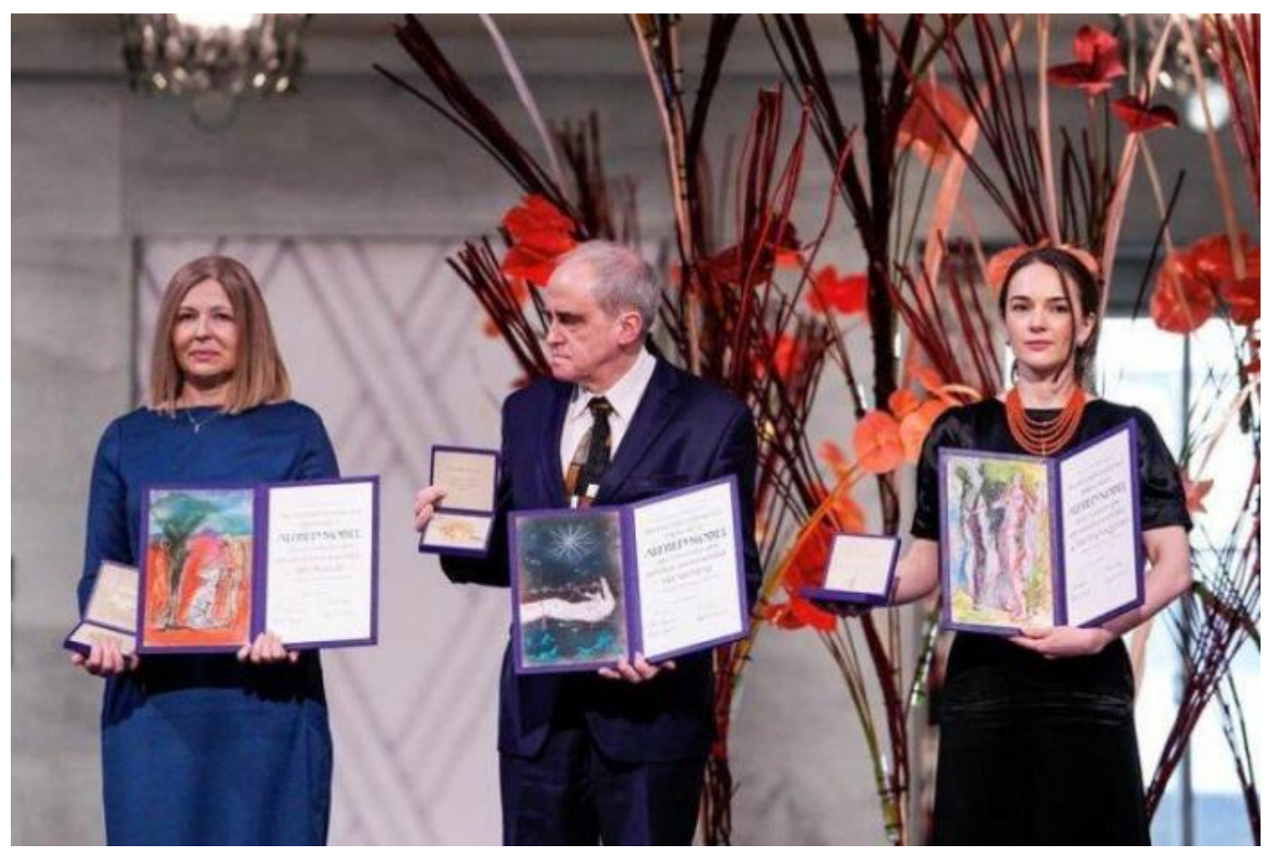
2022 Nobel Peace Prize recipients all have connections to the NED, a CIA offshoot.

Although the idea may seem far-fetched, this year's winners all have connections to a CIA offshoot, the National Endowment for Democracy (NED).