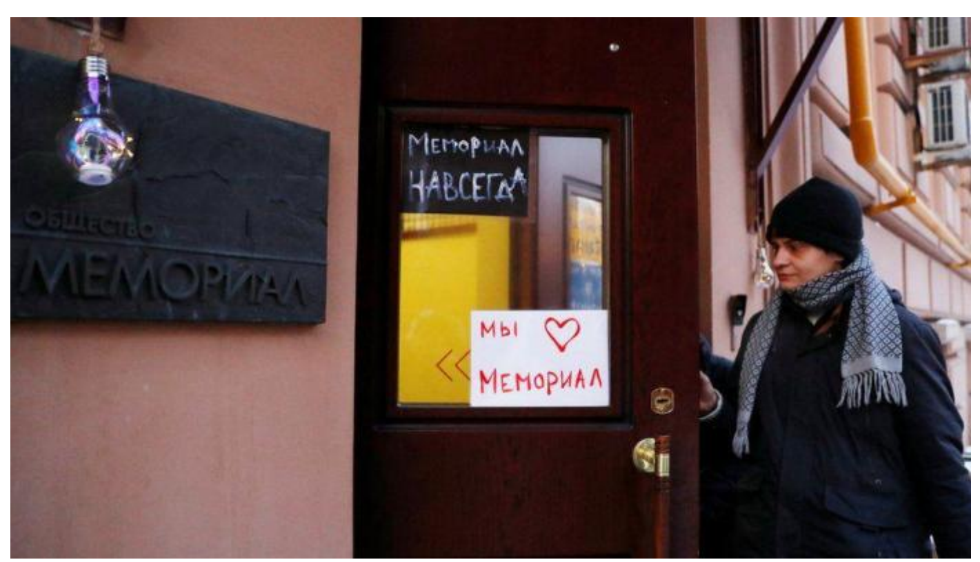
Shuttered office of Memorial after Russian authorities closed it for violating the 2012 foreign agent law.