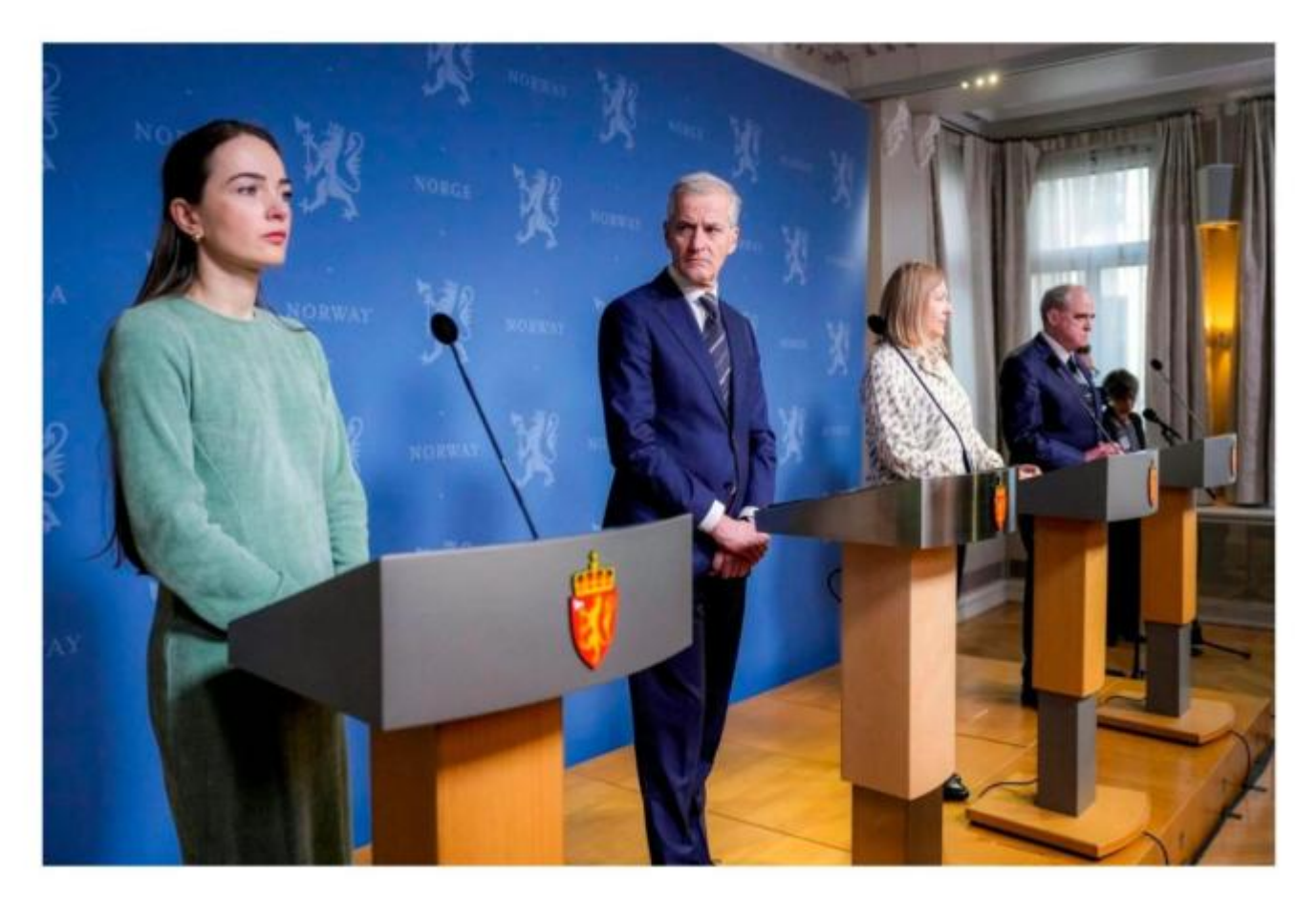
The Nobel Peace Prize recipient in Oslo at a press conference with the Norwegian Prime Minister Jonas Gahr Støre (to her left), from whom she asked to provide her country with more weapons!

means protecting people from its cruelty."