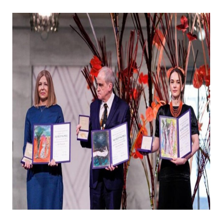
Nobel Peace Prize Winners Have Deep CIA Ties