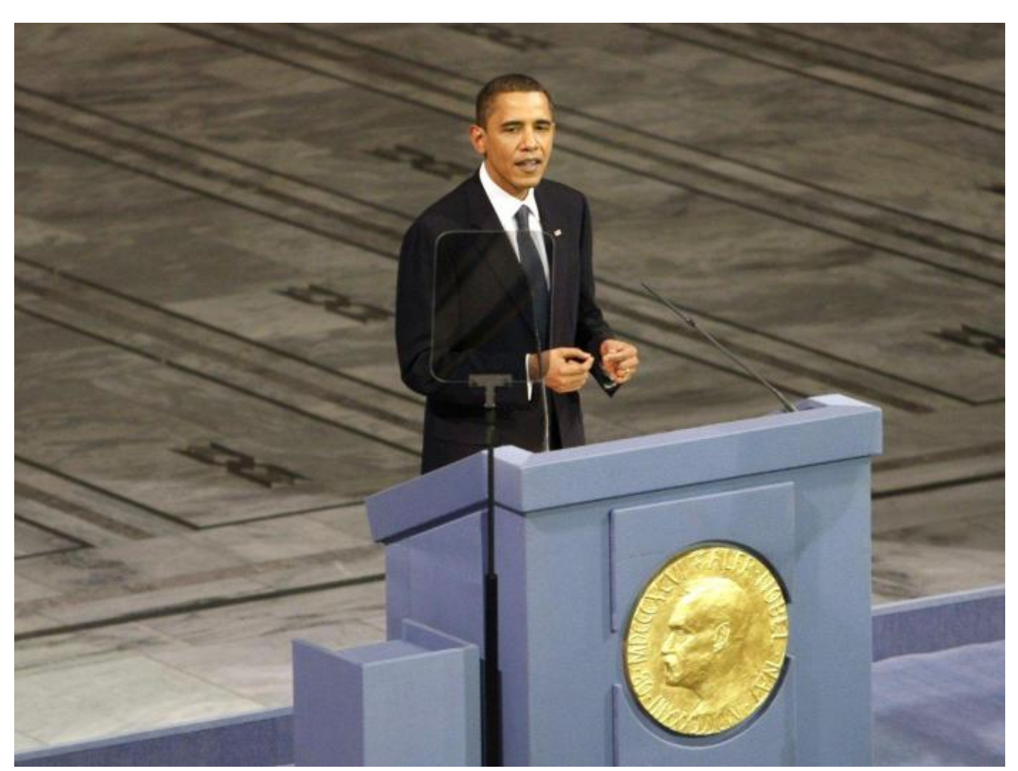
Barack Obama, the drone king and a prolific killer by his own admission, giving Nobel Peace Prize speech in which he gave a torturous defense of the criminal U.S. wars of aggression in the Middle East.