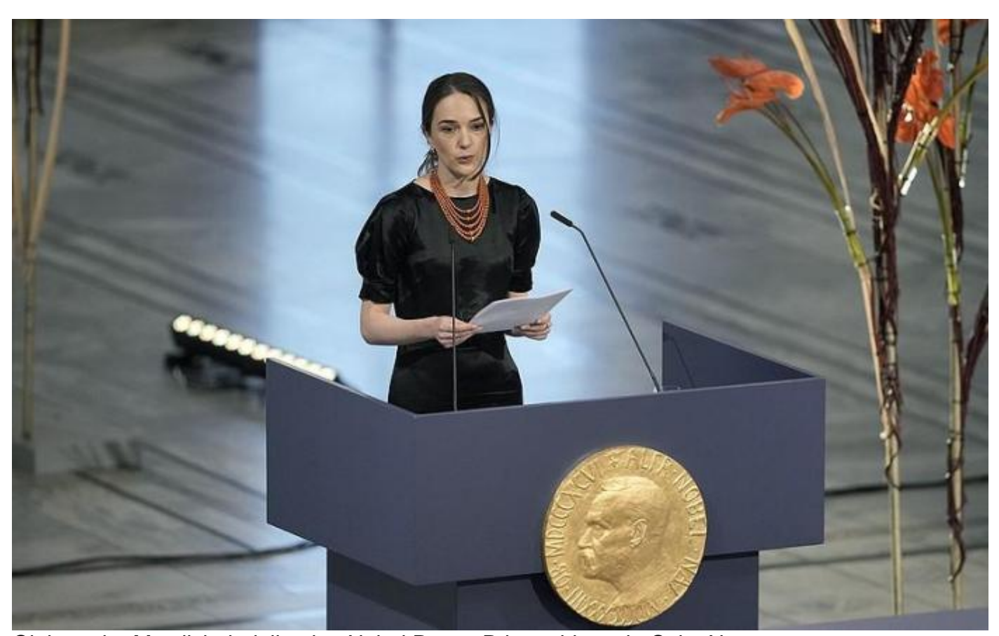
Oleksandra Matviichuk delivering Nobel Peace Prize address in Oslo, Norway, on December 10, 2022.

In Matviichuk's telling, the "innocent" West is complicit in appeasing Russia—though for the last few decades, it was U.S. troops and its proxies that rampaged across the Middle East and committed massive war crimes.