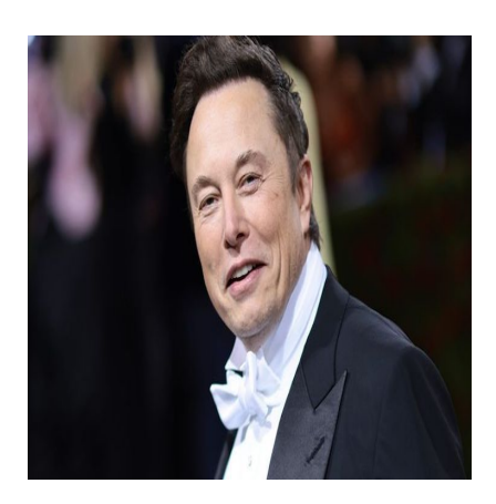
Musk's Dangerous Vision for Twitter Is '1984' on Steroids