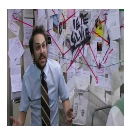
'Made-For-TV' Jan. 6 Hearings Are Ratings Disaster