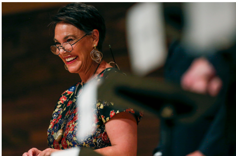
Wyoming Republican Harriet Hageman

Her challenger, Harriet Hageman, was ahead by more than 30% with 13% of the votes counted – enough for NBC News to call it for her.