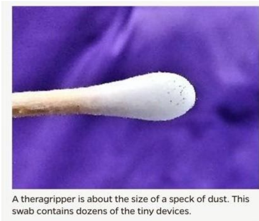
Figure 2: Theragrippers on a cotton swab

The Johns Hopkins University research team published positive results from an animal study as a cover article in Science Advances on October 28, 2020 [5], confirming that the new technology works flawlessly: