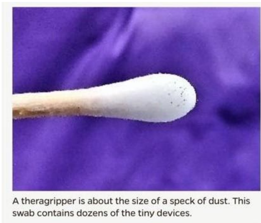
Figure 2: Theragrippers on a cotton swab

The Johns Hopkins University research team published positive results from an animal study as a cover article in Science Advances on October 28, 2020 [5], confirming that the new technology works flawlessly: