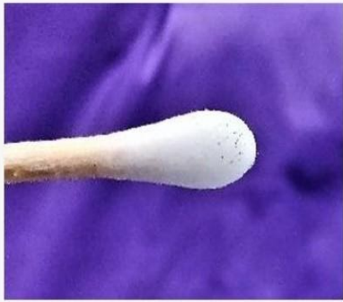
A theragripper is about the size of a speck of dust. This swab contains dozens of the tiny devices.

Johns Hopkins University confirms: You can be vaccinated with a PCR test, even without knowing