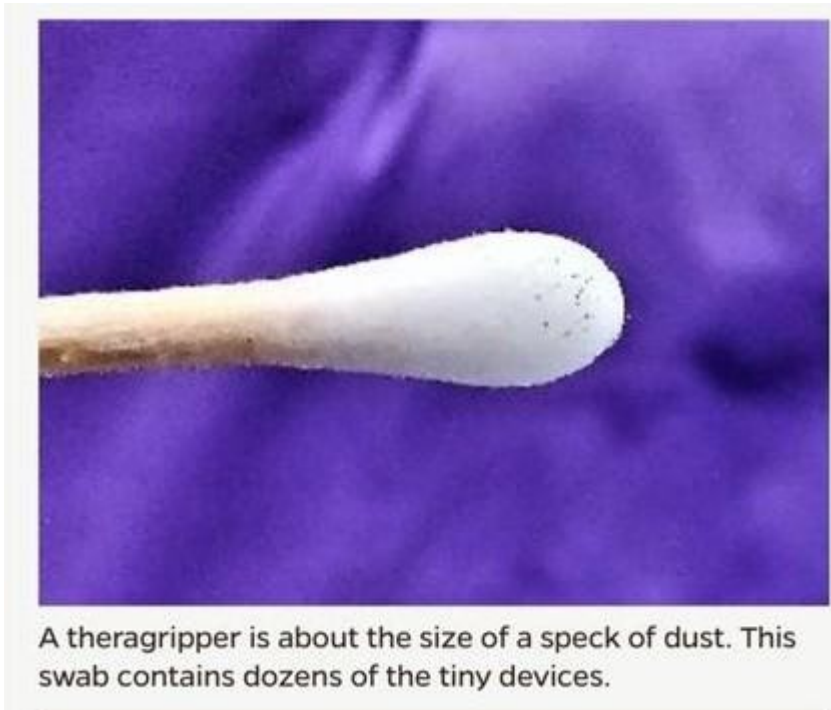
Figure 2: Theragrippers on a cotton swab

The Johns Hopkins University research team published positive results from an animal study as a cover article in Science Advances on October 28, 2020 [5], confirming that the new technology works flawlessly: