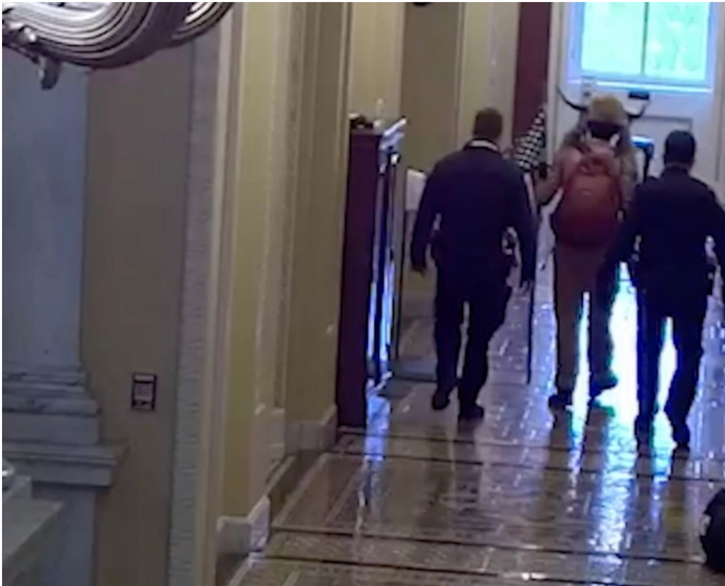
New Capitol riot footage shows police escorted Jacob Chansley to the Senate floor.