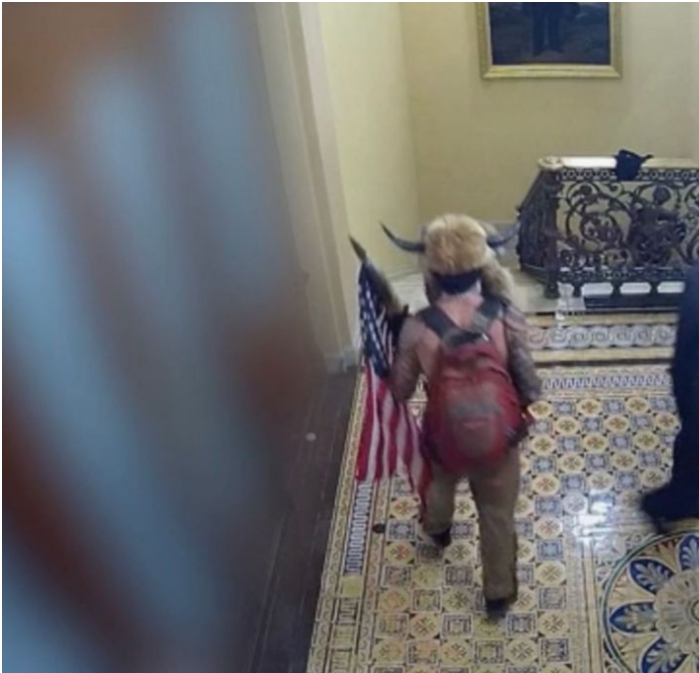
Jacob Chansley has been dubbed the “QAnon Shaman.”