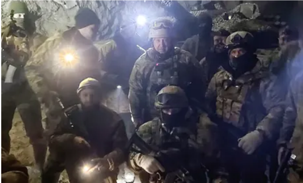
Yevgeny Prigozhin (center) released this photograph of Wagner troops in what appears to be one of Soledar's salt mines, via Telegram.

Britain's Ministry of Defence (MoD) acknowledged in a Tuesday daily briefing that the majority of Soledar is already under Russian control.