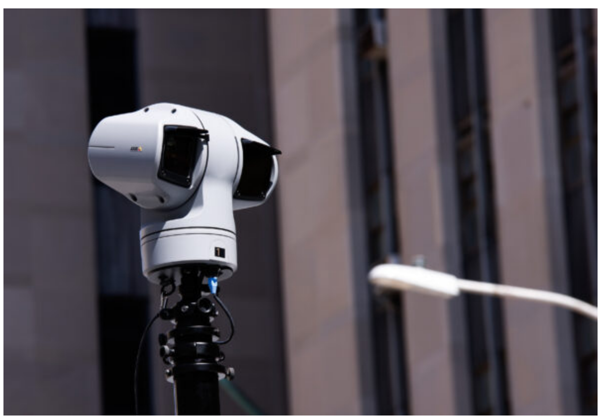
A surveillance camera is placed on a car outside of the Manhattan Criminal Courthouse in New York City on April 3, 2023.

"Instead of protecting the privacy of their depositors, financial institutions are forced to protect the secrecy of government investigations," Nicholas Anthony states in a Cato Institute report, "whether those investigations have a legitimate criminal predicate or not."