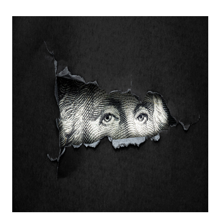
IN-DEPTH: Is Your Money Spying On You?