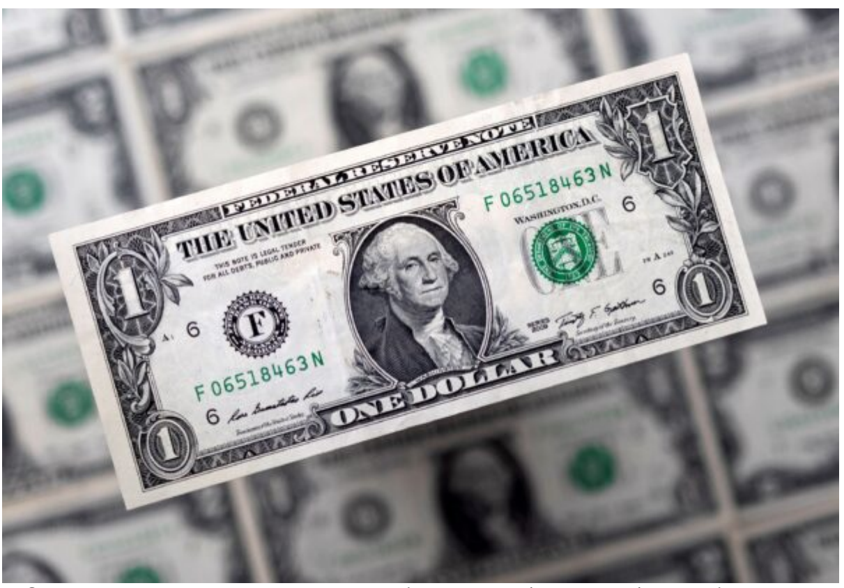
U.S. dollar banknotes on Feb. 14, 2022.