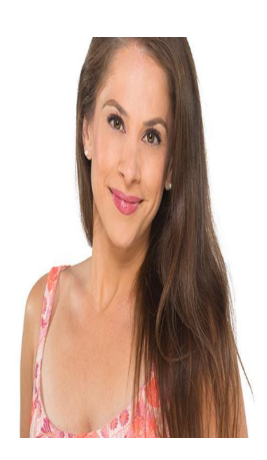
"I'm A Woman": Left Wing Host Ana Kasparian Triggers Woke Mob Over "Trans-Exclusionary" Language