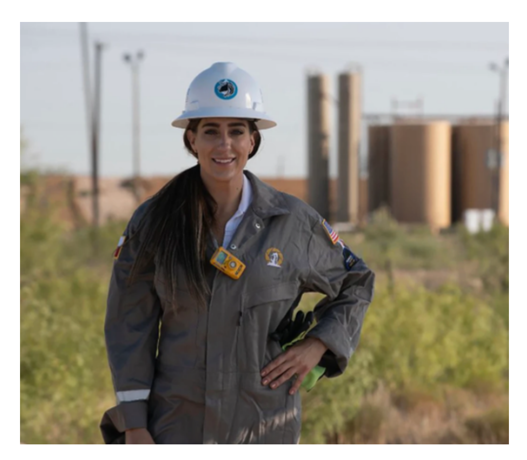
However, her critics came out of the woodwork:

One critic tweeted: "I'm confused. Are you running for political office, or auditioning to be a stripper?"