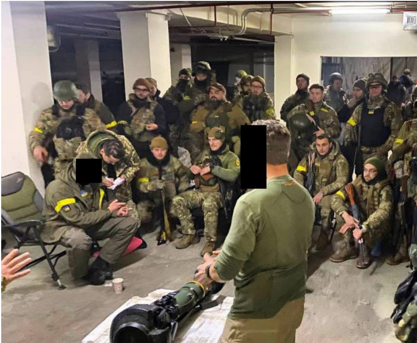
NATO instructing the Ukrainian neo-Nazi Azov Battalion on how to use newly-delivered grenade launchers paid for by American taxpayers.