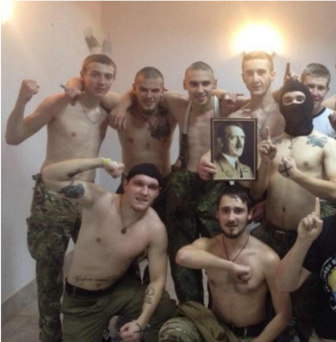
Ukraine's neo-Nazi Azov Battalion holds up a photograph of Adolph Hitler.

The Pandora Papers revealed that the current President of Ukraine, Volodymyr Zelensky, is also financially entangled with Ihor Kolomoysky via off-shore bank accounts .