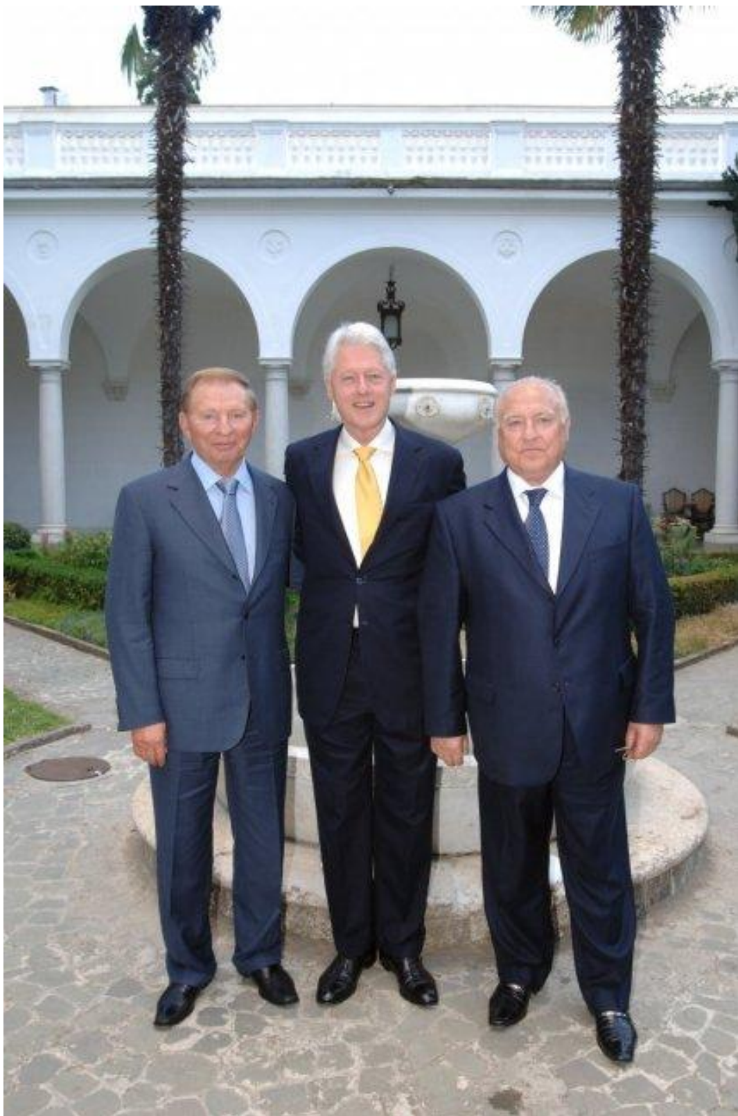
Kravchuk (left) with Bill Clinton in 2007.

Kuchma's attempts to save the ship failed. After constant protests and political pressure, he agreed to step down after the 2004 election, instead putting forth his protégé and Prime Minister, Viktor