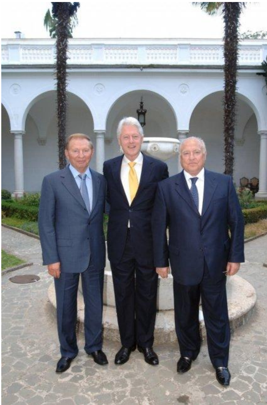
Kravchuk (left) with Bill Clinton in 2007.

Kuchma's attempts to save the ship failed. After constant protests and political pressure, he agreed to step down after the 2004 election, instead putting forth his protégé and Prime Minister, Viktor