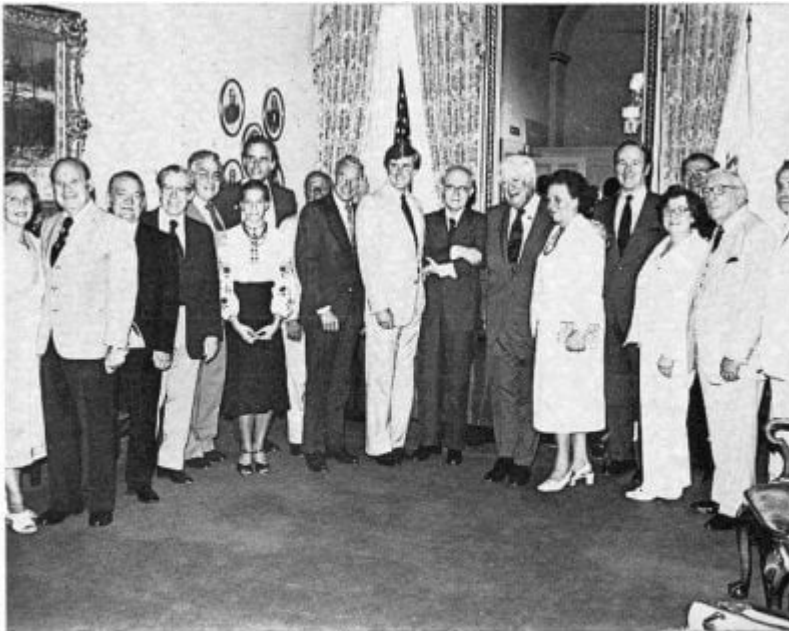
July 15, 1981 — Members of the US Congress meeting with the former Prime Minister of Ukraine and the President of the ABN — Hon. Yaroslav Stetsko in the offices of Hon. T. O'Neill, the Speaker of the House, on the occasion of the recent Congressional commemoration of the 40th anniversary of the Re-establishment of Ukrainian Statehood in 1941.

"Terror will be not only a means of self-defense, but also a form of agitation, which will affect friend and foe alike, regardless of whether they desire it or not." —UVO (fascist Ukrainian Military Organization) brochure from 1929