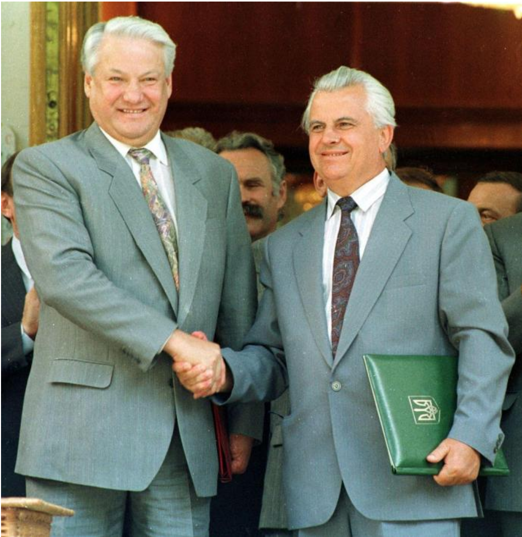
Leonid Kravchuk (right) with Boris Yeltsin.

ships transferred to offshore holding companies beginning in 1993. In 1991, the fleet of 280 ships was the third largest in the world. By 2004, only six remained.