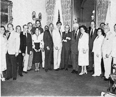
July 15, 1981 — Members of the US Congress meeting with the former Prime Minister of Ukraine and the President of the ABN — Hon. Yaroslav Stetsko in the offices of Hon. T. O'Neill, the Speaker of the House, on the occasion of the recent Congressional commemoration of the 40th anniversary of the Re-establishment of Ukrainian Statehood in 1941.