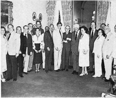
July 15, 1981 — Members of the US Congress meeting with the former Prime Minister of Ukraine and the President of the ABN — Hon. Yaroslav Sietako in the offices of Hon. T. O'Neill, the Speaker of the House, on the occasion of the recent Congressional commemoration of the 40th anniversary of the Re-establishment of Ukrainian Statehood in 1941.