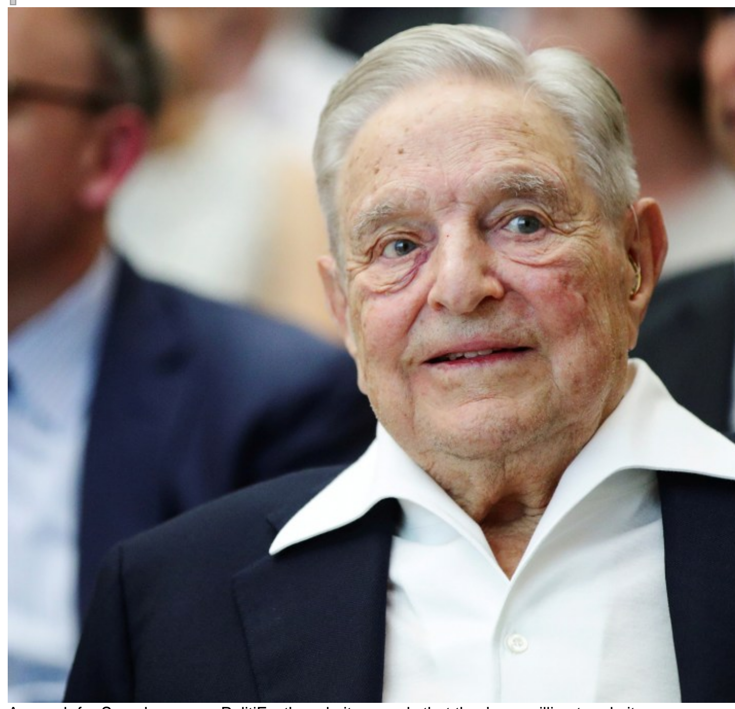
A search for Soros' name on PolitiFact's website reveals that they're unwilling to admit a single allegation made against the man.

The IFCN acts as the "high body" for the dozens of fact-checking organizations under its umbrella, which unite under a shared code of principles, and a mission "to bring together the growing community of fact-checkers around the world and advocates of factual information in the global fight against misinformation."