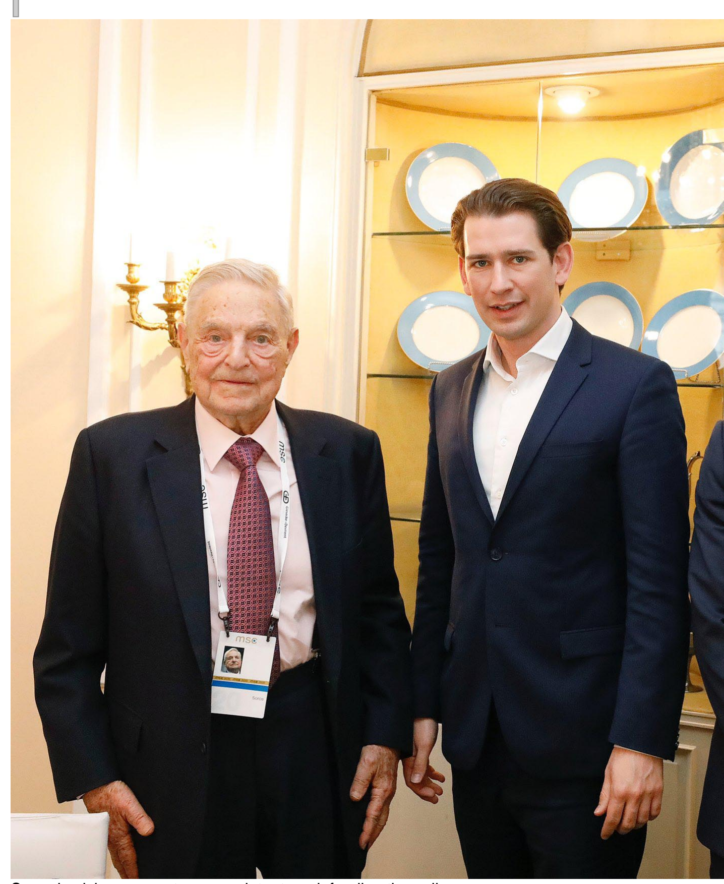
Soros is giving money to groups intent on defunding the police.