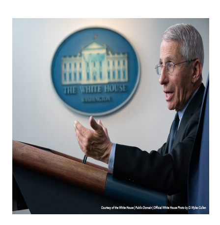
How Fact-Finding Fauci Led To My Cancellation At Forbes