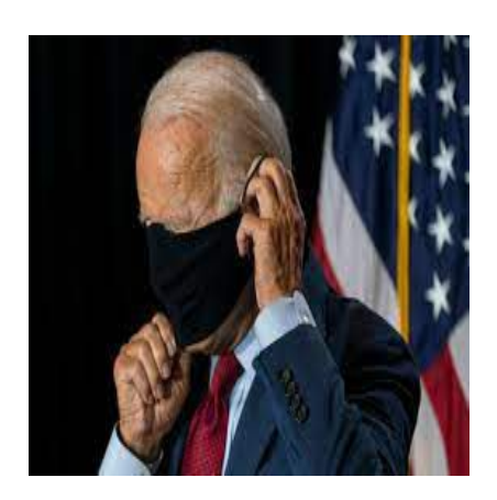
HHS Report Says Face Masks & Social Distancing Should Be Encouraged Or Mandated