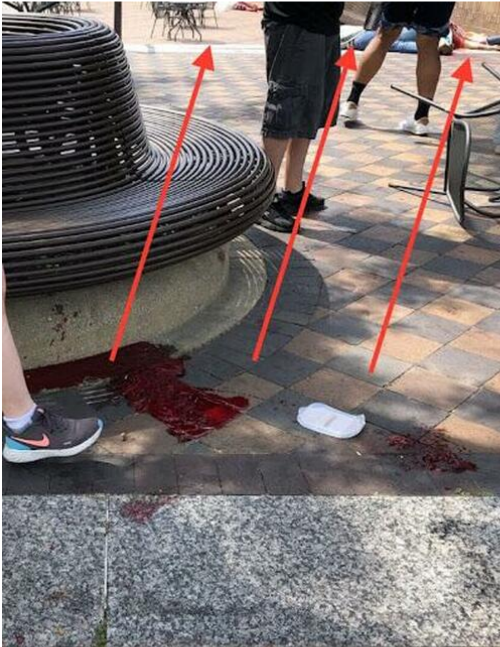
Blood pooled at Port Clinton Square in Highland Park.

Cops are still going to the scene pic.twitter.com/gL3Gjhl7V