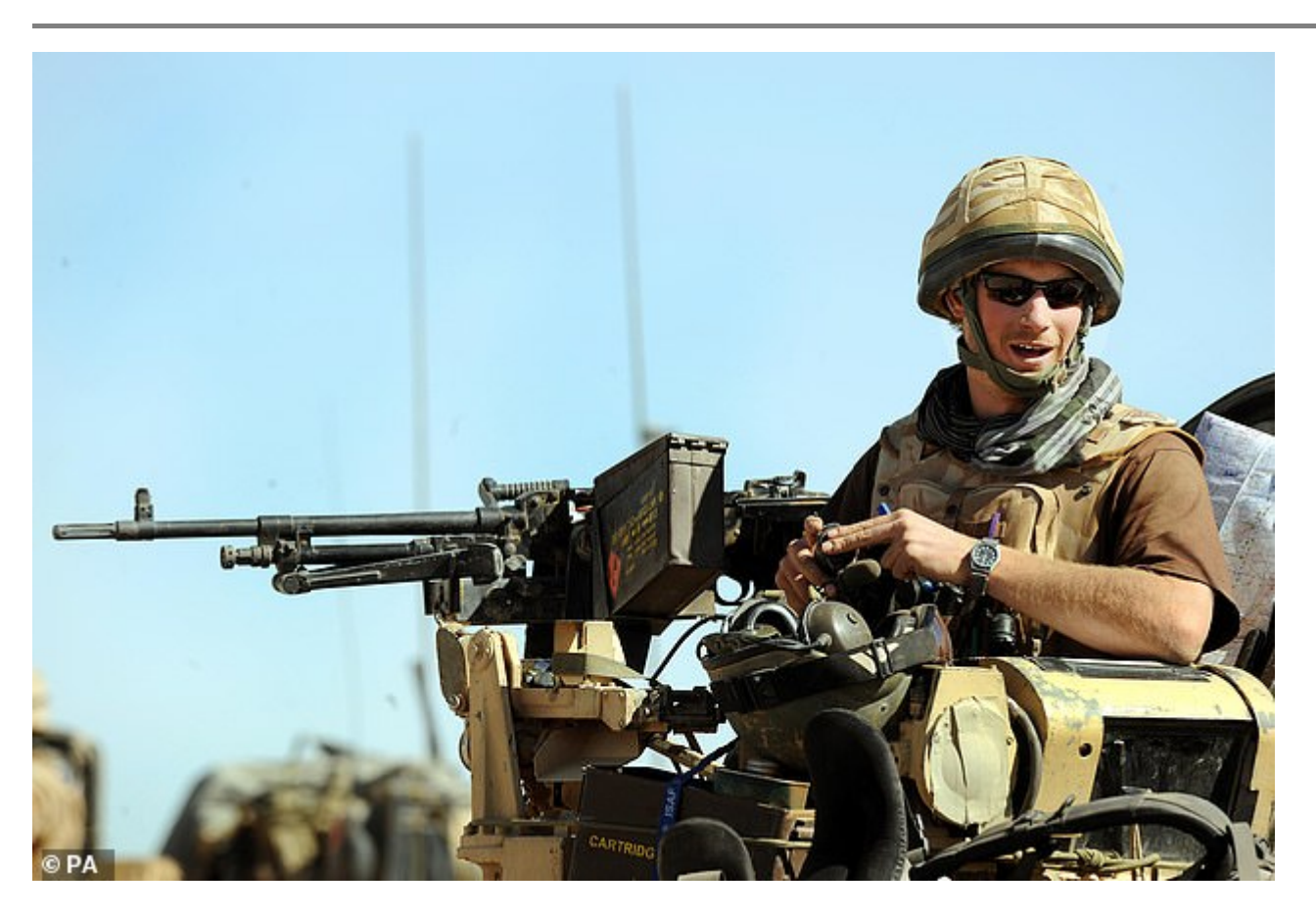
The Duke of Sussex pictured in Helmand province during his first tour of duty in 2008