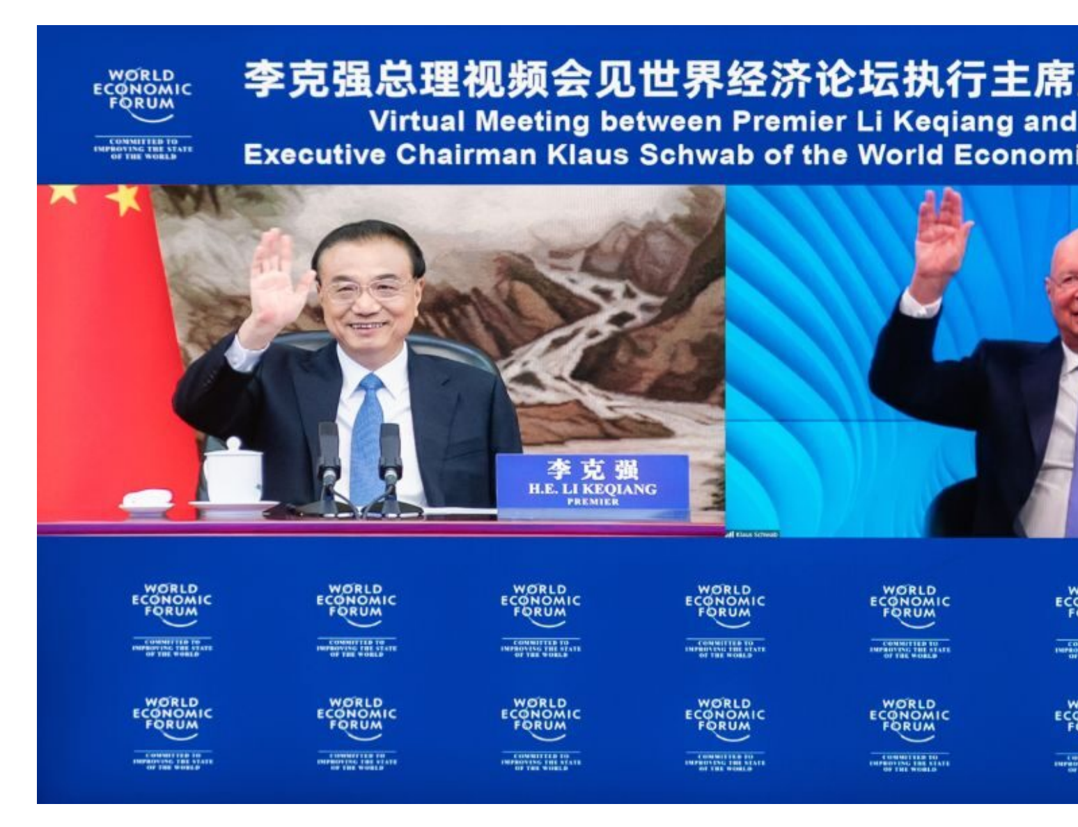
Chinese Premier Li Keqiang meets with Klaus Schwab, executive chairman of the World Economic Forum WEF, via video link at the Great Hall of the People in Beijing, capital of China, July 19, 2022.

Just what the future holds for cryptocurrencies is another issue that consumes the WEF.